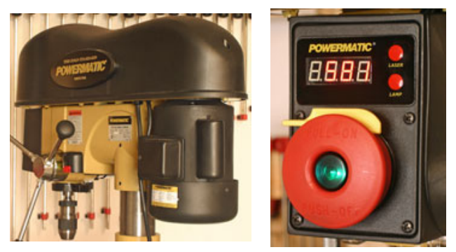
The full 1 HP motor (left) and control panel (right) make controlling the PM2800 for your job easy. The green pilot light in the center of the red pull On, push Off button is an indication that the PM2800 is connected to electrical current.

The POWERMATIC 18" Drill Press is powered by a heavy-duty 1HP, 1Ph, 115/230V, 15/8-amp, TEFC (totally enclosed fan cooled) motor to be sure you have plenty of power for the tough jobs. The motor, rated using a continuous duty cycle rather than the "peak" or "max developed" formulas, is the most powerful in this class. The motor comes pre-wired for 115V power but can be converted to use 230V.